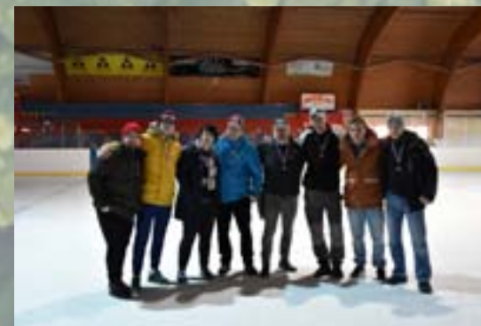
VŠETKY TÍMY SPOLU